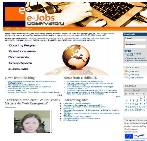
Fig. 1. Snapshot of the e-jobs Observatory platform ( http://www.e-jobs-observatory.eu/ )

One of the main objectives of the PIN Project is creating a network of key players in the area of internet-related jobs converging around a web 2.0 platform. The platform is available for stakeholders and accessible at http://www.e-jobs-observatory.eu/ (see fig. 1). The Observatory platform can be used by businesses, training organisations, as well as vocational organisations. It is a web-based information exchange platform that operates as a central reference point and collaborative tool for all the stakeholders. The direct results from using this platform are the dissemination of the provided information and the reinforcement of the cycle of interaction between the key participants. Every person that participates in this interactive system has the ability to influence the ongoing development and formulates a better picture of future trends and developments in the field.