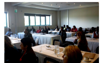
See above a photograph of the well attended symposium in Limerick, Ireland on October 3rd, 2012

several honourable university professors and experts in the field of social justice, cultural diversity, education, law, leadership and sustainable development from Ireland and further European partner countries.