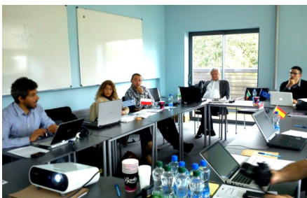
The SONETOR partnership discussing and deciding on materials and contents at their meeting in Limerick, Ireland.