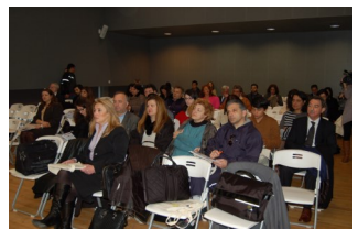
A picture from the SONETOR conference, held in Patras on the 8th and 9th of January. For more information, read below.

the project cycle, guaranteeing the continuous exchange of ideas and know-how among the members of this community