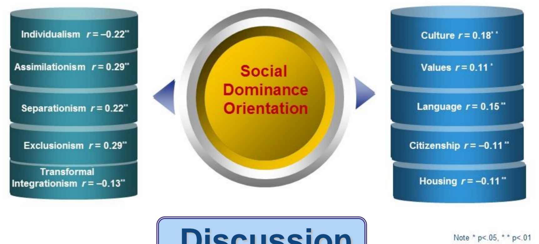
Graph 3. Systematic correlations (Pearson r ) of SDO with HCAS and acculturation expectations in domains of culture.

To assess SDO (SDO7 scale short form; Ho et al., 2015) the scale was translated in Greek and back translated in English language. This scale consists of 8 items measuring the desire for inequalities versus egalitarianism (e.g., "Some groups of people are simply inferior to other groups"). A 7likert agreement/disagreement scale was used, where higher scores mean stronger desire for inequalities ( \alpha = .74 ).